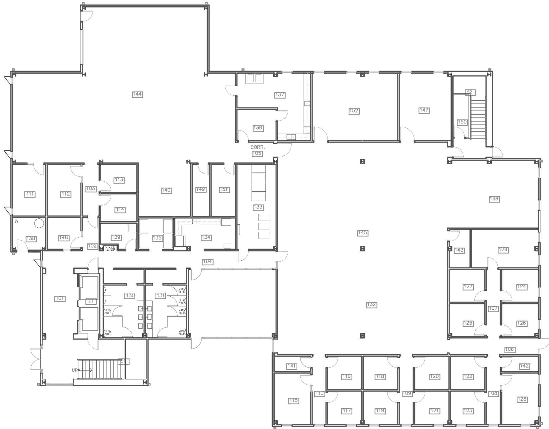
A FLOOR PLAN — LEVEL 1 1/8"=1'-0" NORTH