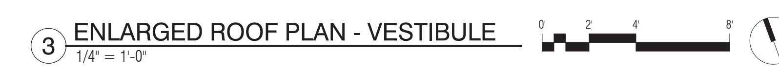
3 ENLARGED ROOF PLAN - VESTIBULE 1/4" = 1'-0"